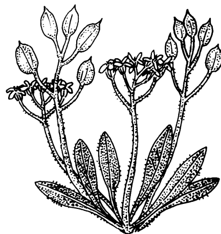
Ballantinia antipoda . R. Hale

This species is presumed extinct. There is currently no information available regarding the key sites and the number of populations and/or individuals for this species.