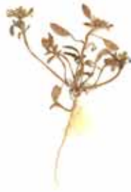
Ballantinia antipoda . Tasmanian Herbarium specimen