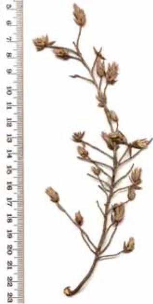
Brachyloma depressum . Tasmanian Herbarium specimen.