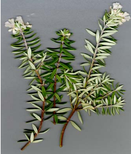
Westringia brevifolia var. raleighii . Threatened Species Unit.