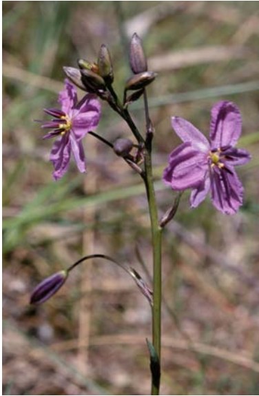
Arthropodium strictum . H & A Wapstra.