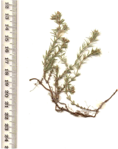
Asperula scoparia var. scoparia . Tasmanian Herbarium specimen.