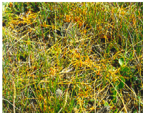
Cuscuta tasmanica habit.

There is currently no information available regarding the ecology and management of this species.