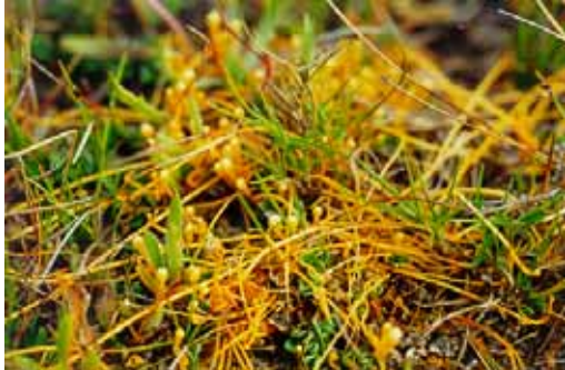
Cuscuta tasmanica .