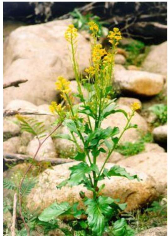
Plate 1. Barbarea australis growing amongst river rocks (image by Mick Ilowski)