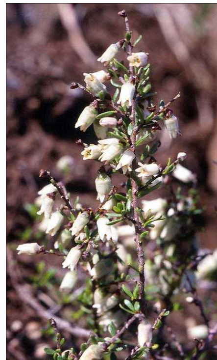
Plate 1. Cryptandra amara in flower