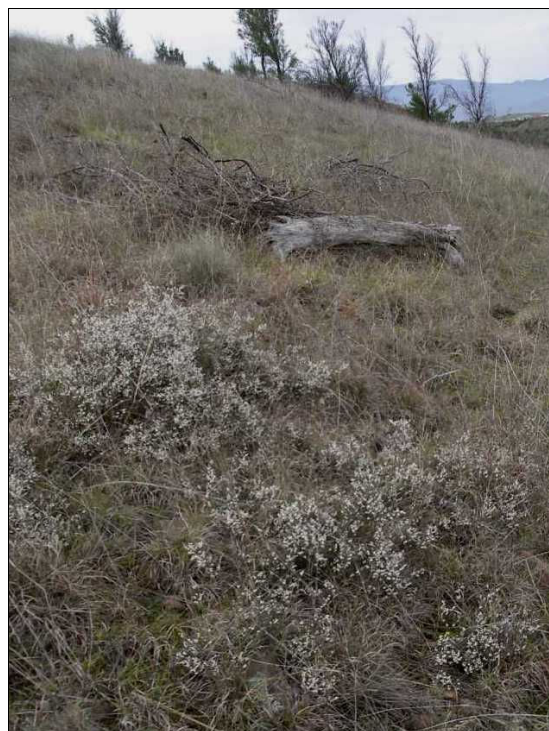
Plate 2. Cryptandra amara : rocky grassland habitat at Pontville

The species has a linear range in Tasmania of 140 km and an extent of occurrence of about 7200 km 2 ; reliable estimates for the total area of occupancy are unavailable (Table 1).