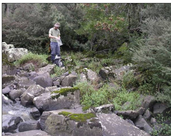
Plate 2. Mentha australis along the Rubicon River

In Tasmania, Mentha australis has been observed growing along the rocky (dolerite) margins of rivers and lakes (Plate 2). Associated species include the native Gratiola peruviana and Carex appressa , and the weeds Alisma plantago-aquatica , Cyperus eragrostis , Lotus corniculatus , Mentha pulegium , Rorippa palustris , Persicaria maculata , Persicaria prostrata and Ranunculus repens . Riparian native scrub species may include Leptospermum lanigerum , Acacia melanoxydon , Acacia mucronata , Pomaderris apetala , Notelaea ligustrina , Callistemon pallidus and Beyeria viscosa .