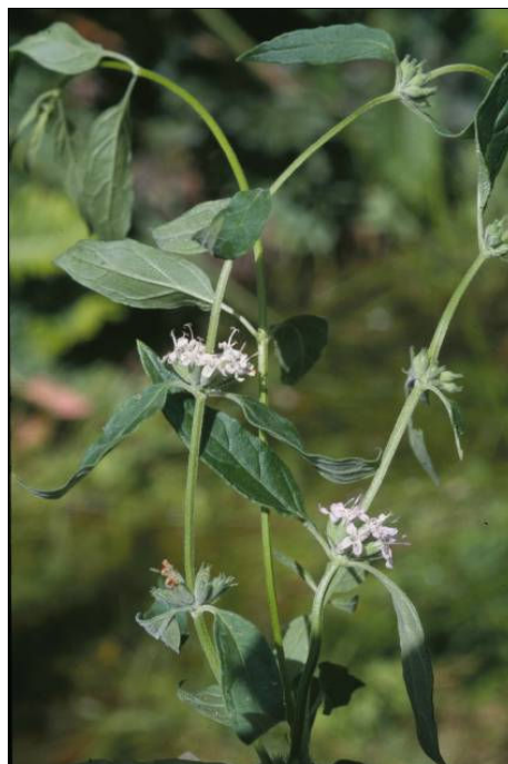
Plate 1. Mentha australis